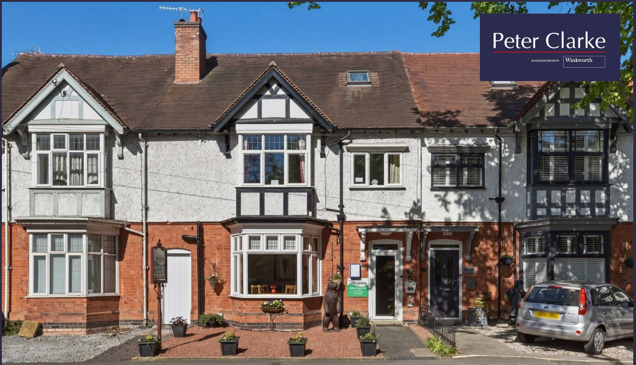
Ashgrove House, 37 Grove Road, Stratford-upon-Avon, CV37 6PB